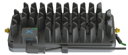
CEL-FI ROAM R41