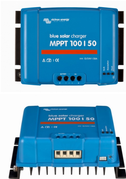
Solar Charge Controller MPPT 100/50